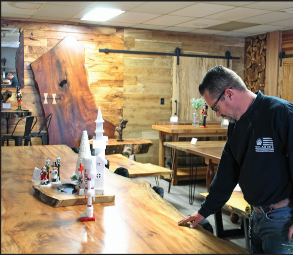
From clothing, furniture and home goods to antiques, gifts and dining options to truck accessories, El Campo offers it all.

Partnering with the City of El Campo, the Chamber of Commerce and Retail Strategies to expand existing businesses and recruit new retail to the city.